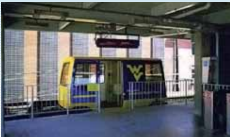
Morgantown GRT: an existing scheme serving the University of West Virginia, USA