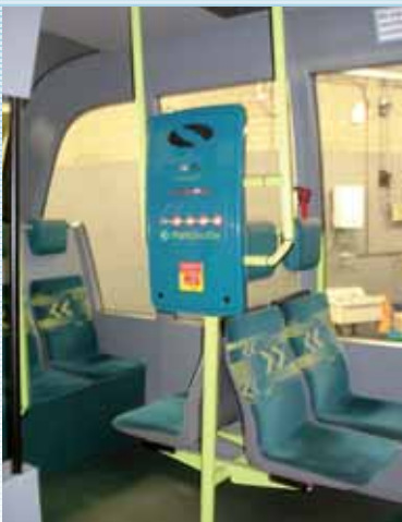
On the Parkshuttle Cyberbus: press a button to select your destination stop

Buyers may be public transport operating companies or local authorities. Their additional concerns relate to factors concerning operations, maintenance, costs and financial viability.