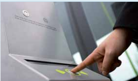
Parkshuttle stop: press the button to call a Cyberbus