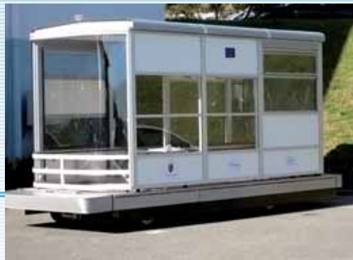
Cyberbus developed by Robosoft for use at the new Rome Exhibition Centre