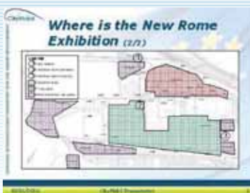
The new Rome Exhibition Centre