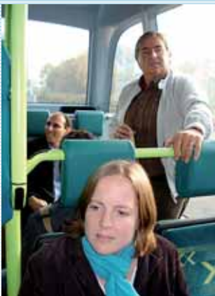
On the Parkshuttle