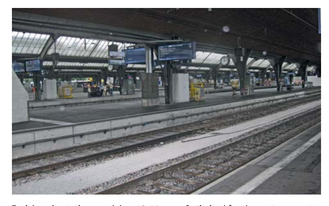
Zurich main station: weekday, 12:14 p.m.: Optimised for the customer, not the operator. In 10 minutes' time, every platform will be full.