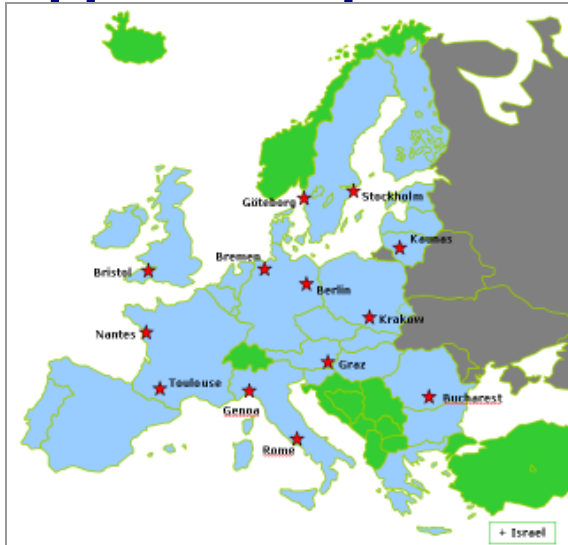
CATALIST cities and eligible area