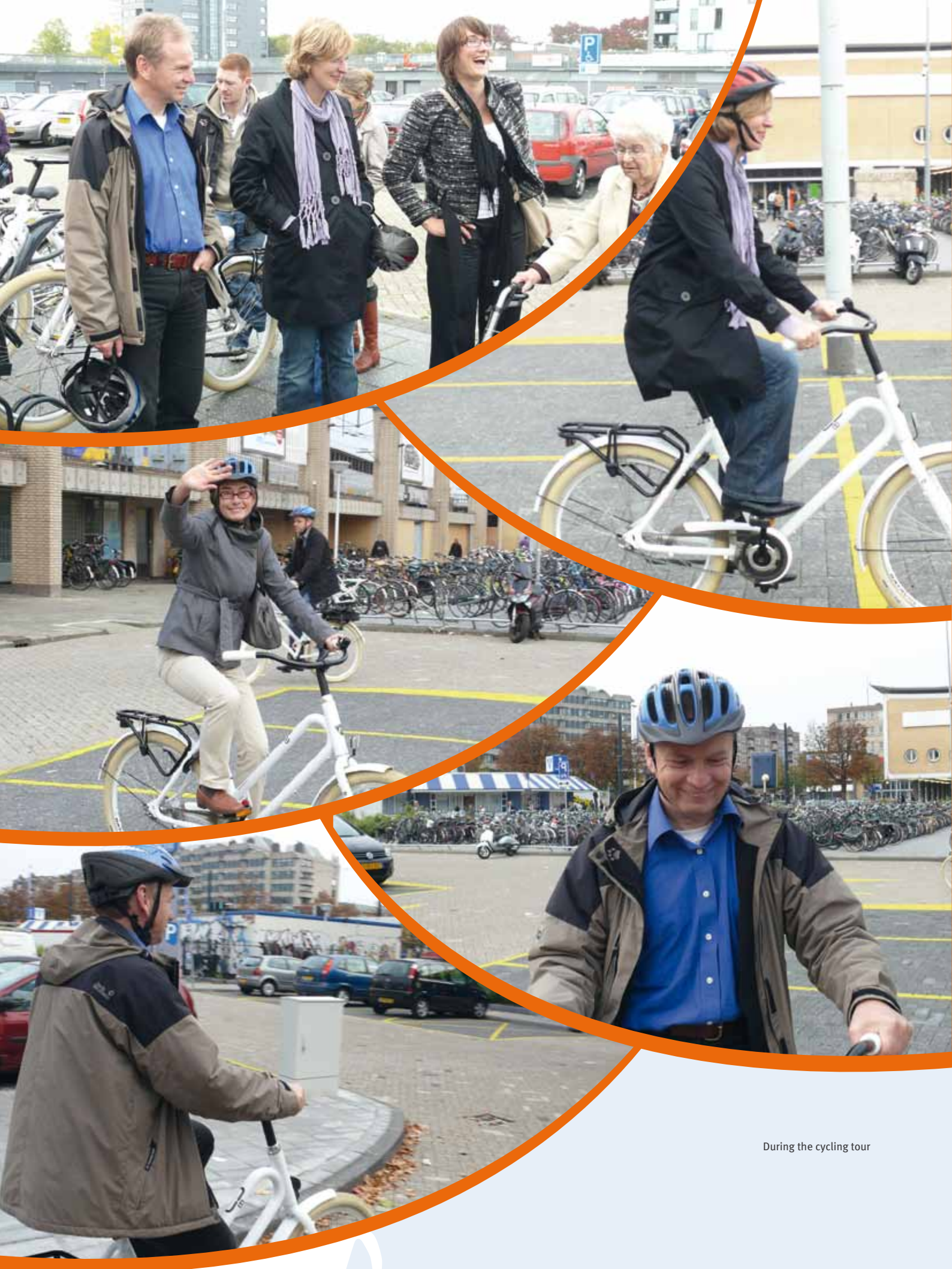
During the cycling tour