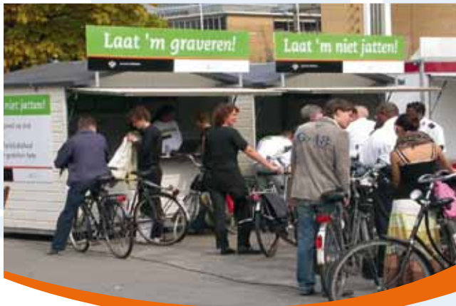
Cycling promotion in Eindhoven

At present in Eindhoven, urban transport is dominated by cars, adding to congestion, parking problems and deteriorating air quality. Therefore the goal of the transport strategy is to increase the share of public transport in the modal split by 50% until 2020, and bike transport by 10%. For the latter, a 7.5 million euro bike-supporting scheme has been developed. Key elements of this scheme are: