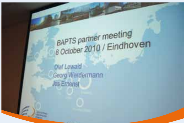
At the BAPTS partner meeting

On Friday the BAPTS partners gathered for their regular partner meeting. After the obligatory update from the lead partner the partners discussed the details of potential project modifications (Request for Change) and prepared for a successful final project year.