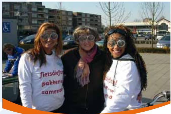
Cycling promotion in Eindhoven