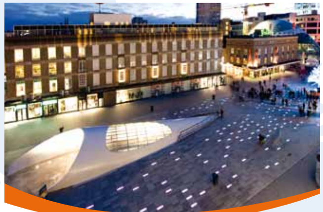
The entrance to the sustainable transport storage facility

Subsequently René Schepers introduced to the BAPTS partners the concept of the “18 Septemberplein” (a large square in the city centre), and its sustainable transport storage facility. The key feature of this brand new facility is the combination of guarded bike storage for citizens and an attractive design (by the Italian architect Fuksas) for visitors and tourists. Inside the storage the historical Eindhoven town wall and an exhibition of other archaeological remnants contrast with the futuristic exterior of the storage. The project was co-financed by the province of Noord-Brabant and the European Regional Development Fund (ERDF).