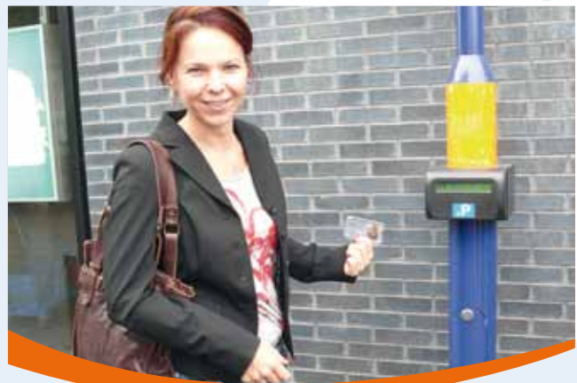
Stadspas card reader

alty plans and bonus systems for sustainable travel modes. Whereas initially, shop owners did not favour this payment method, claiming that it would scare off customers from the mall, they now fully support the scheme.