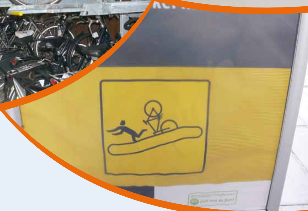
7 – 8 October 2010 | 7 th BAPTS Partnership Meeting/Workshop/Site Visit