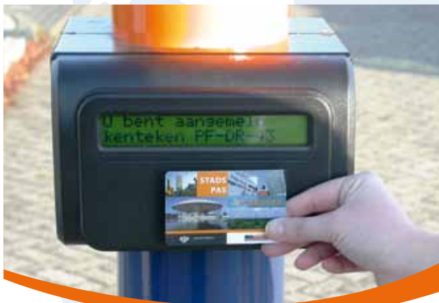
Stadspas card reader

Fiona Janssen from the Eindhoven city council and Rob Werkhoven (Empaction consultants) explained that it was vital to connect paid parking with a Stadspas-based payment scheme. It offers the possibility to link paid parking with other mobility functions such as free public transport and cycle hire. This makes the Stadspas parking pilot the ideal platform to experiment with influencing travel behaviour, for example by introducing mobility management measures, loy-