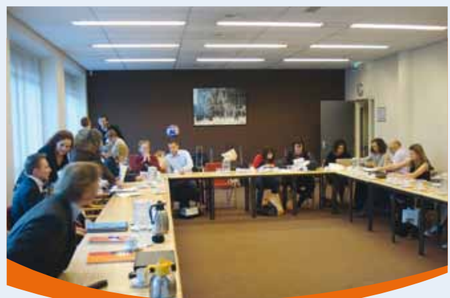
At the BAPTS partner meeting