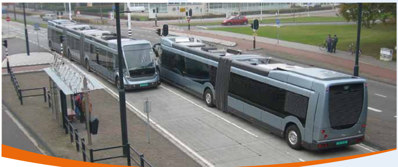
Phileas in operation on the integrated corridor

HOV which stands for Hoogwaardig Openbaar Vervoer (High-quality public transport) describes an integrated concept of a new Bus Rapid Transit (BRT) scheme based on the existing Phileas system.