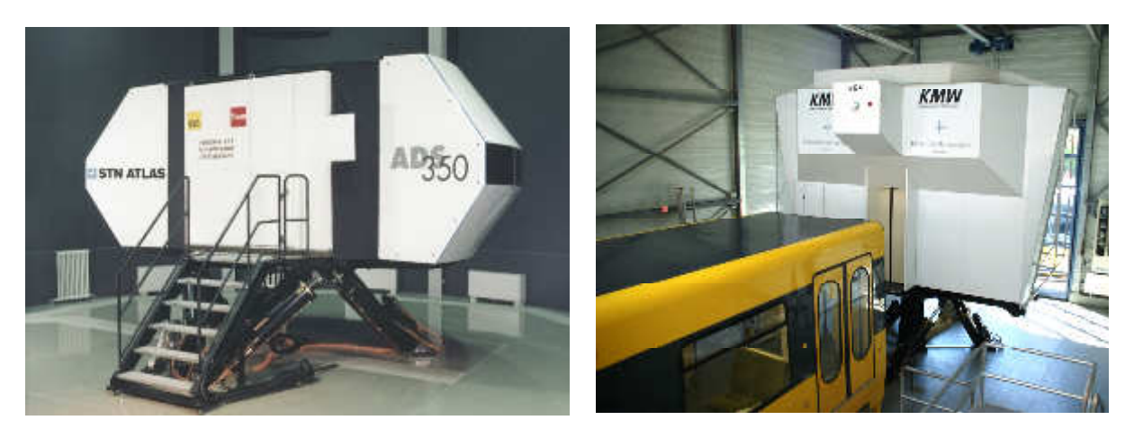
Figure 1 and 2: Full cabin simulators (1. generation): BVG-Tram (left), SSB-AG Stadtbahn (right), view presentation via projection, 6 DOF electromechanical moving system

Examples of different types of Simulators: