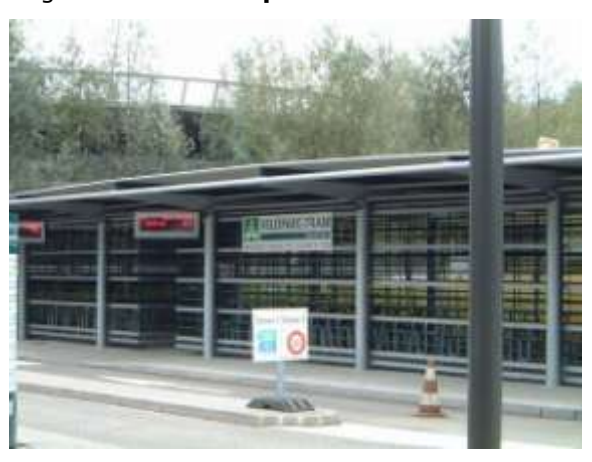
Covered bicycle parking tramway stops (Véloparc at Strasbourg)