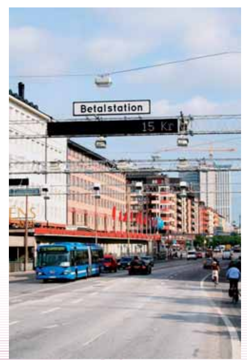
Stockholm Congestion Charging Scheme Trial

«The Congestion Charge continues to be highly effective in decreasing congestion in the Capital. Traffic levels and associated carbon emissions have been cut, bus services have improved, the roads are safer, and London's air quality has improved thanks to reduced vehicle emissions. The Congestion Charge provides vital funds which are invested back into London's transport system, and into encouraging walking, cycling and greater use of public transport. Cities from across the world can look to our scheme as a benchmark for how to tackle the economic and social problems associated with congestion.»