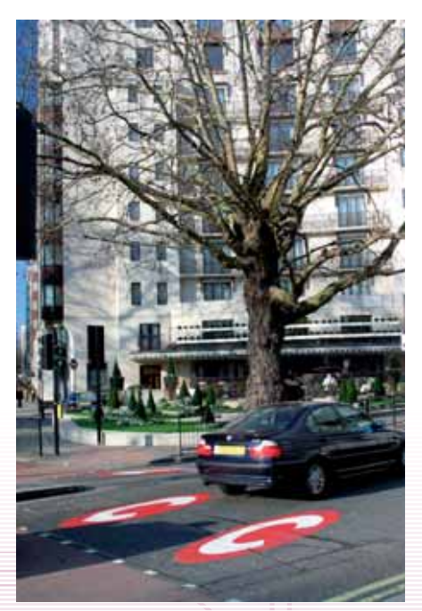
London Congestion Charging Scheme

Consult the public and stakeholders and keep them informed: Social acceptance plays a vital role in the feasibility of the implementation of a pricing scheme. Three aspects need to be addressed: social exclusion, economic viability and privacy of the users. Fairness or social equity are key words determining the acceptability of the