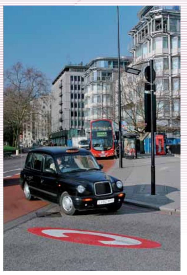
London Congestion Charging Scheme

Concretely, reduction of congestion has been maintained at an average level of 30%. Ongoing improvements to the bus network continue to bring benefits and quality of life has improved and is acknowledged. London also succeeded in reducing road traffic accidents within the charging zone and on the boundary route. A 12% reduction in emissions of key traffic pollutants has also been achieved.