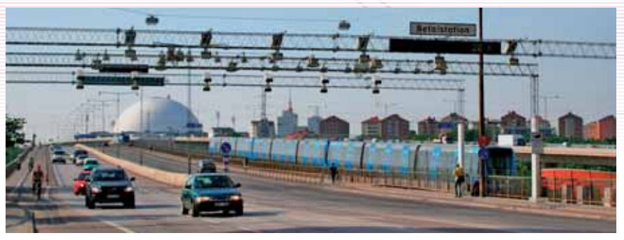
Stockholm Congestion Charging Scheme Trial

Maintain flexibility: It is unlikely that the initial pricing scheme will remain unchanged as it needs to adapt with changing local conditions. Prices might need to be revised, boundaries readjusted, technology upgraded and rules improved.