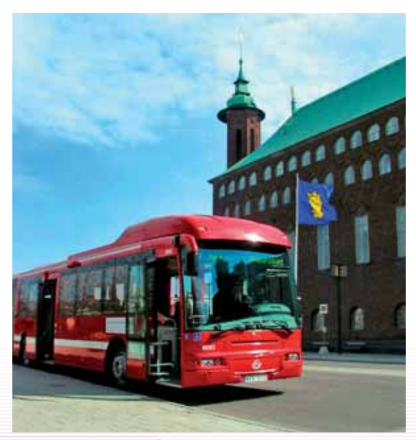
Stockholm Bus

The best is to keep the system simple and use proven technology. A way to significantly increase the risk of failure in a large-scale technical project is to use technologies that have not been commercially proven.