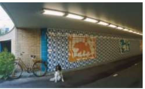
Berenput Utrecht