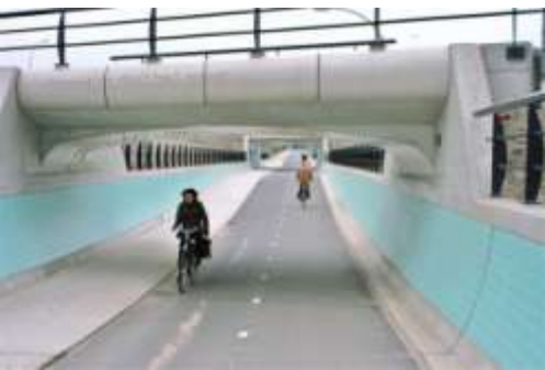
Good cycling tunnel design and cycle tunnel