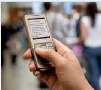
Traveline NextBuses Service

Accessibility for users with impairments is also enhanced through supply of on-trip information with the understanding of their specific needs: examples include hands-free audible information for visually impaired users, wheelchair users or parents travelling with children. Nevertheless, it is important to ensure that these users are aware of the customised services available to them. MTIS also offer the opportunity to promote existing and new transport services so that users are always aware of alternatives.