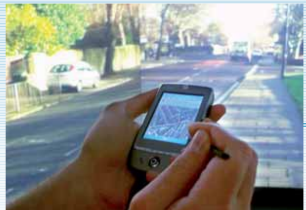
Navigation information on a PDA

A secondary aim is to provide transport planners and emergency services with data which assist them in carrying out their roles effectively. The whole system must work reliably from the implementation phase into the full operational phase to instil confidence in the users that required services will be delivered when needed.