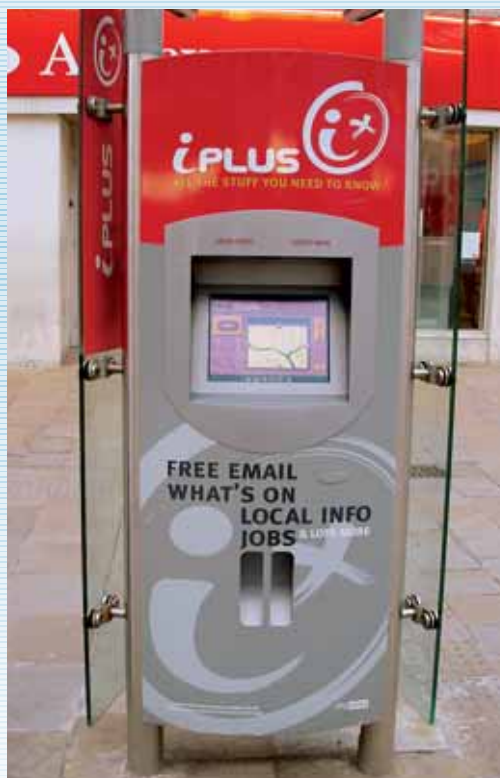
On-street information kiosk

The most successful measures are therefore those which can be perceived as having personal benefits rather than social impacts. For example, CO 2 targets have to be achieved, but this particular pollutant may not resonate with people at an individual level; it may be easier to engage the public when attempting to reduce other pollutants that they perceive as impacting on them more directly, e.g. noise.